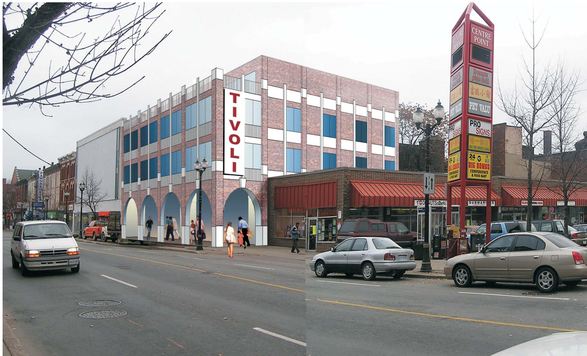
OPTION 3 FOUR-STOREY NEW DEVELOPMENT ON JAMES STREET WITH EXISTING AUDITORIUM & INNER COURT YARD