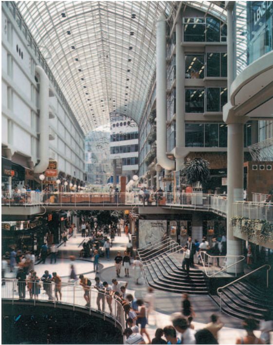
Toronto Eaton Centre