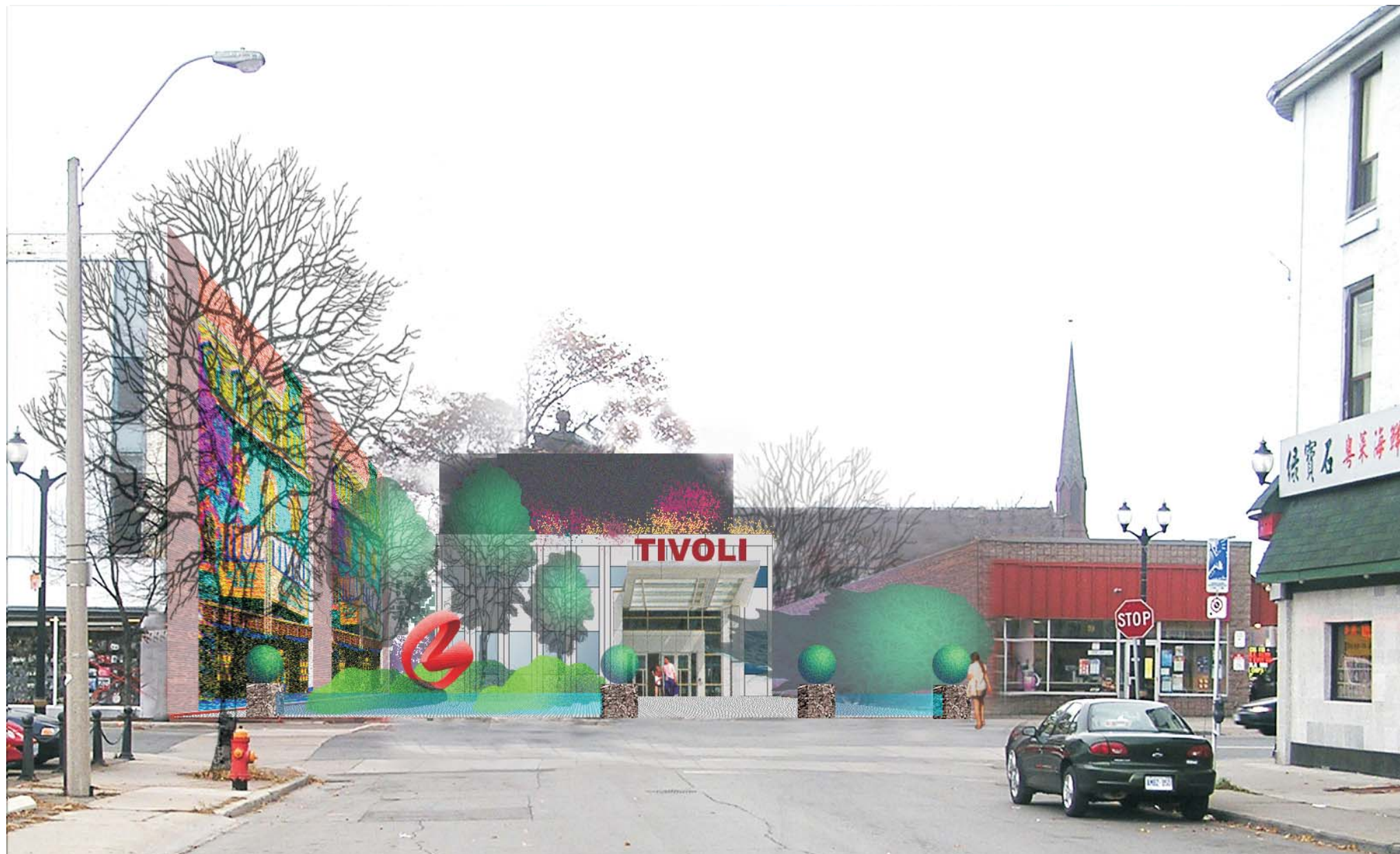
OPTION 1 FORE COURT TO THEATRE WITH NEW LOBBY